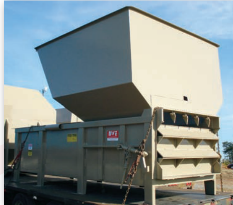
S300 3yd Compactor w/ Pin Off