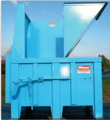
S200 2yd "Shorty" w/ Side Load Hopper