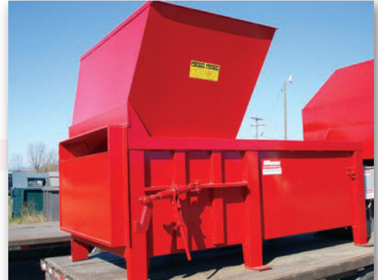
S200 2yd Compactor w/ Load Hopper