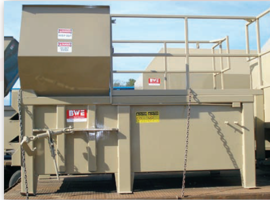
S200 2yd w/ Walk on Deck/Hopper