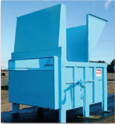
S200 2yd "Shorty" Compactor